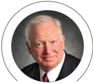
Hon Kent D. Engle 20th Circuit Court